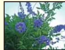
WISTERIA ( Wisteria spp.)