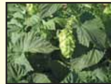
HOPS VINE ( Humulus lupulus )