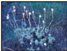
PUSSYTOES ( Antennaria spp.)