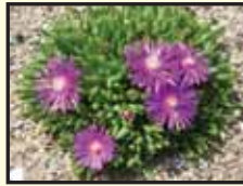
PINK ICEPLANT ( Delosperma cooperi )