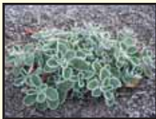
SILVER EDGED HOREHOUND ( Marrubium rotundifolium )