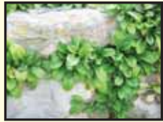
AJUGA ( Ajuga reptans )

Giant flowered soapwort contains soap, which facilitates higher fire resistance. It blooms throughout the summer, and grows 6" tall x 48" wide.