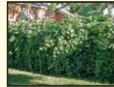
VIRGINIA CREEPER ( Parthenocissus quinquefolia )