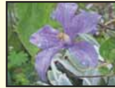
CLEMATIS ( Clematis spp.)