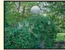
SILVER LACE VINE ( Polygonum aubertii )