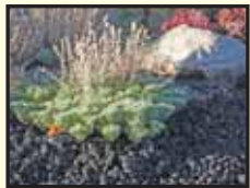
CAUCASICA SAGE ( Artemisia caucasica )