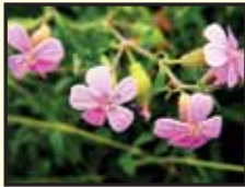
ROCK SOAPWORT ( Saponaria ocymoides )