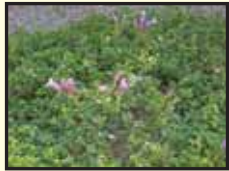
GREEN MAT PENSTEMON ( Penstemon davidsonii )