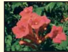
TRUMPET VINE ( Campsis radicans )