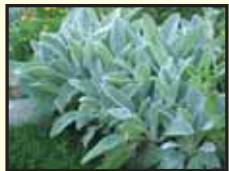
LAMB'S EAR ( Stachys byzantina )