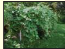
GRAPE VINE ( Vitis spp.)