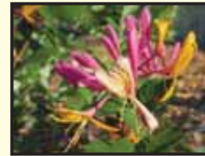
HONEYSUCKLE ( Lonicera spp.)